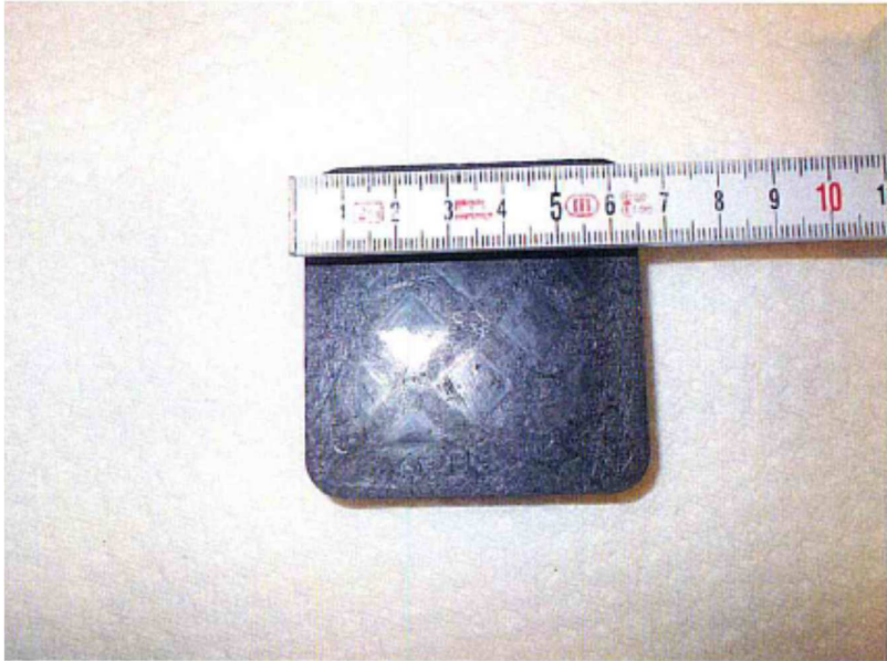
Fig. 3: Mounting plate UP 15 NA lightweight before load test.