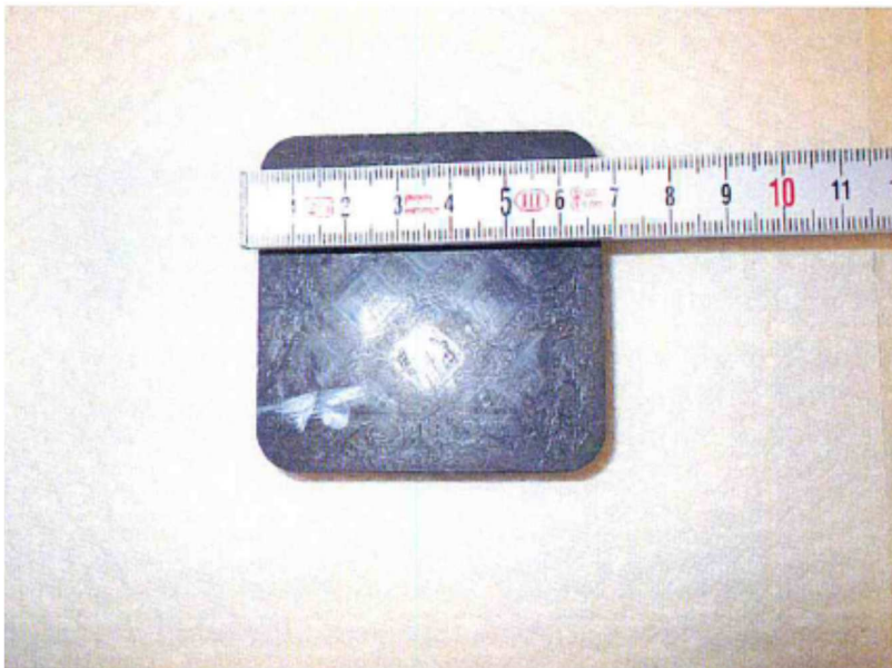
Fig. 4: Mounting plate UP 15 NA lightweight after maximum stress, with slight discernible deformation.