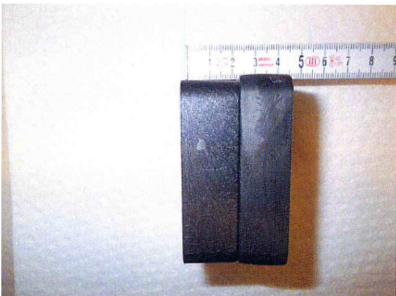
Fig. 2: Mounting plate UP 20 NA lightweight after maximum stress, with distinctly discernible deformation in the plate on the right.